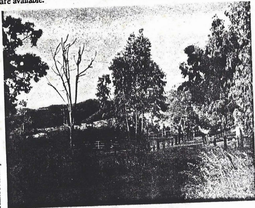
James P. Kenney

At Eagle Junction the Backbone Trail again takes two routes. The right trail (Musch Ranch Trail) drops down to a campground at Musch Ranch. Overnight camping, showers, restrooms, and water are available.