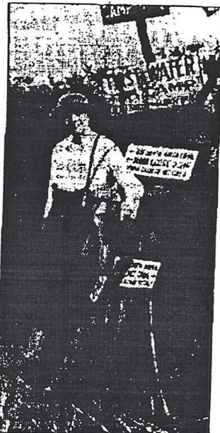
Hiker on Moccasin Trail, 1920s.

distinct trail plunges down a chaparral-lined ravine.